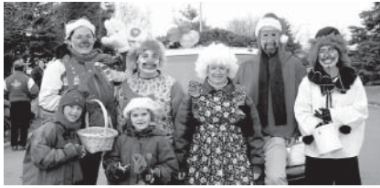
Staff and volunteers clowning around at the Kanata Santa Claus Parade.

WOCRC staff would like to thank the 293 volunteers who generously gave 19,049 hours of their time in 2004-05 to better their community. Your kindness, commitment and energy are greatly appreciated.